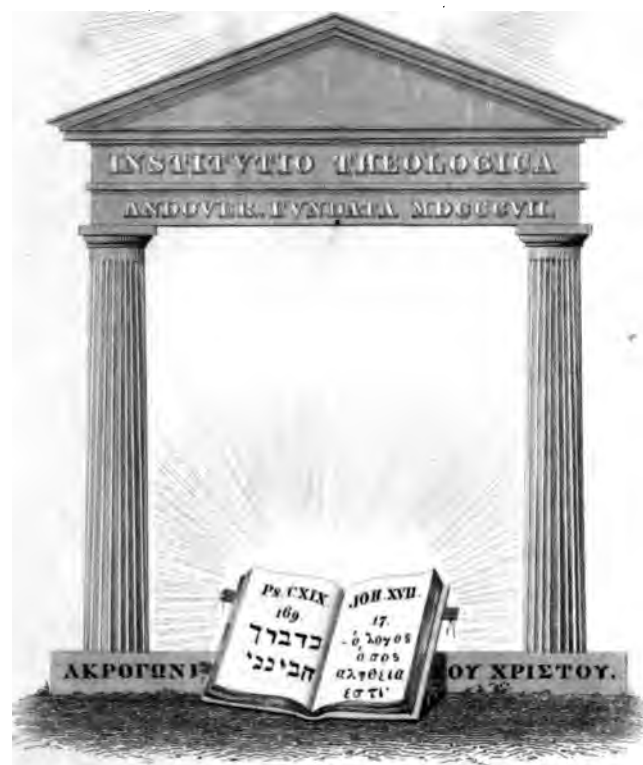
ANDOVER-HARVARD THEOLOGICAL LIBRARY MDCCCCX CAMBRIDGE, MASSACHUSETTS